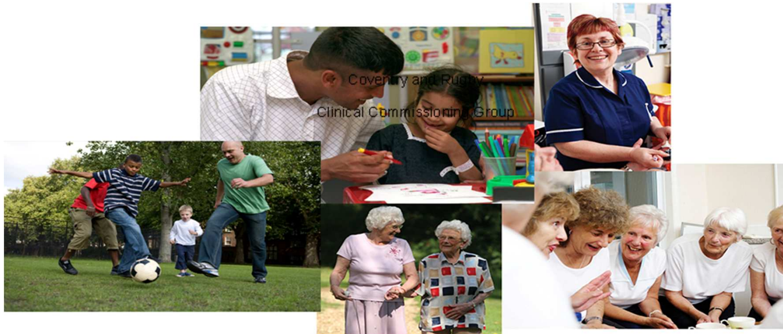
Coventry and Rugby Clinical Commissioning Group